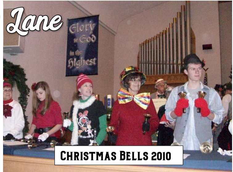
CHRISTMAS BELLS 2010