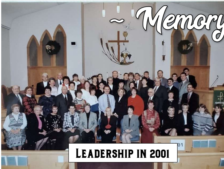
LEADERSHIP IN 2001