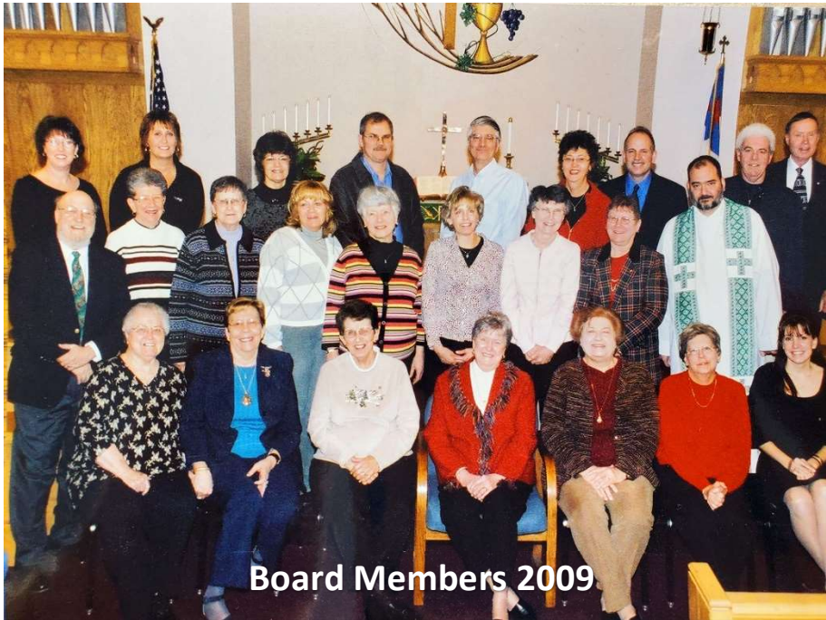
Board Members 2009